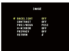
IMAGE SETTINGS 06